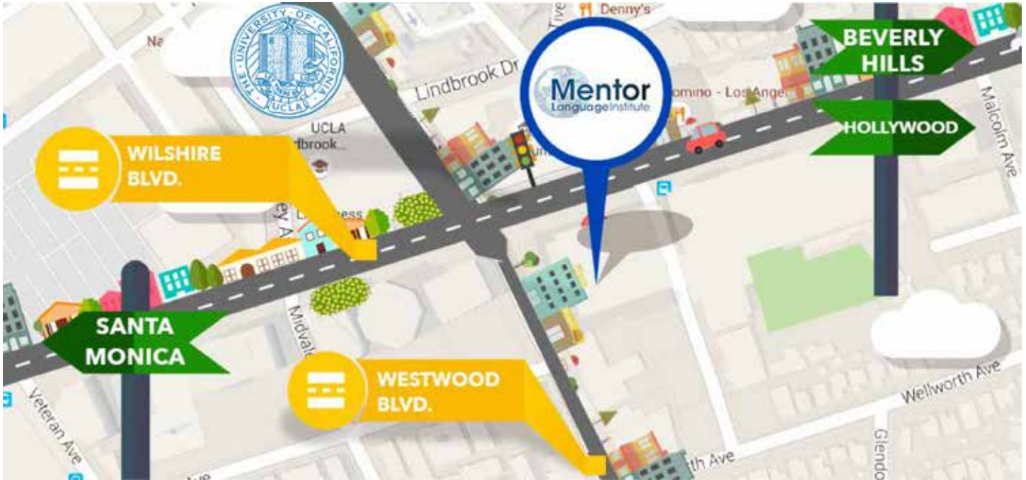
Westwood Campus: 10880 Wilshire Blvd., Suite 122, Los Angeles, CA 90024

Bus stop: 1min walk UCLA: 5 mins walk Santa Monica City: 15 mins by Bus Beverly Hills: 5 mins by Bus Restaurants/Cafés: walking distance